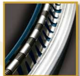
MILL-RIGHT® ES (HNBR) BLUE

300°F Continuous Operating Temp. 350°F Peak Temp.