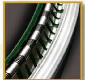
MILL-RIGHT® V (Fluoroelastomer) GREEN

400°F Continuous Operating Temp. 450°F Peak Temp.