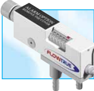
Flow Ranges (XX):