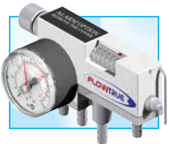
Flow Ranges (XX):