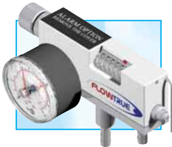
Flow Ranges (XX):