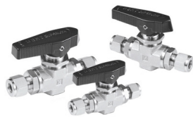
High Pressure Forged Ball Valves