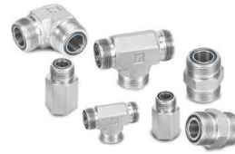
O-Ring Face Seal Fittings