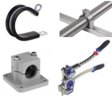
Tube Clamps, Clips & Benders

OUR MISSION STATEMENT TO PROVIDE OUR CUSTOMERS WITH UNMATCHED QUALITY, VALUE, AND INNOVATION.