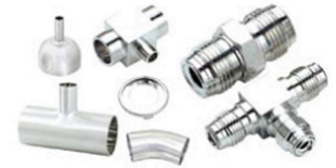
High Purity Fittings