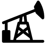
Oil & Gas