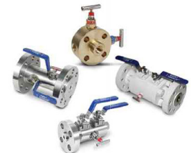
Double Block & Bleed Valves