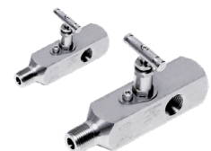
Gauge & Gauge Root Valves