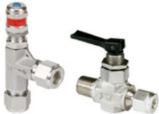
Relief & Toggle Valves