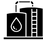
Water & Wastewater