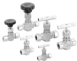
Integral & Union Bonnet Needle Valves