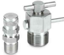
Bleed & Purge Valves