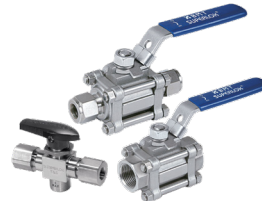
Trunnion & Swing-out Ball Valves