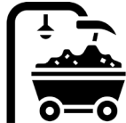
Mining & Minerals