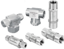
Micron In-line & Tee Filters