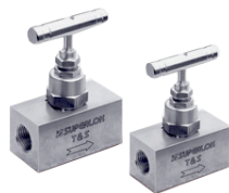
High Pressure Bar Stock Needle Valves