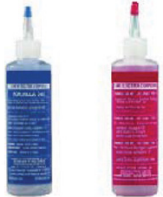
Leak Detection Fluids