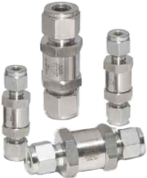
Check Valves & Excess Flow Valves