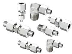
37° Flared Tube Fittings