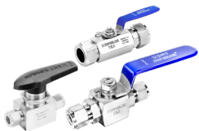
Ball Valves One-, Two- & Three-piece Body