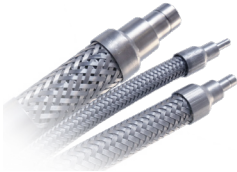
Flexible Metal Hose