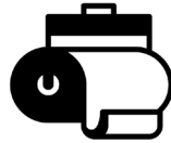
Pulp & Paper