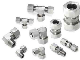
Bite Type Tube Fittings