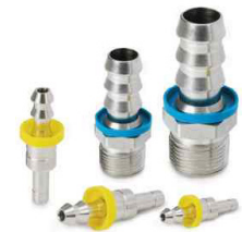
Push-On Hose Fittings