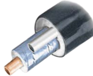
Tube Bundles/ Heat Trace